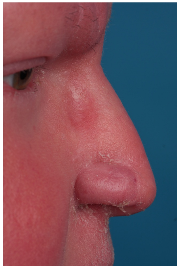
Figure 3 11 months postoperative follow up. The patient did not request a 3 rd stage refinement procedure to enhance the appearance of the pedicle scar.

the development of the malignancy. The definite cause of the susceptibility to squamous cell carcinoma in Netherton syndrome remains yet unknown.