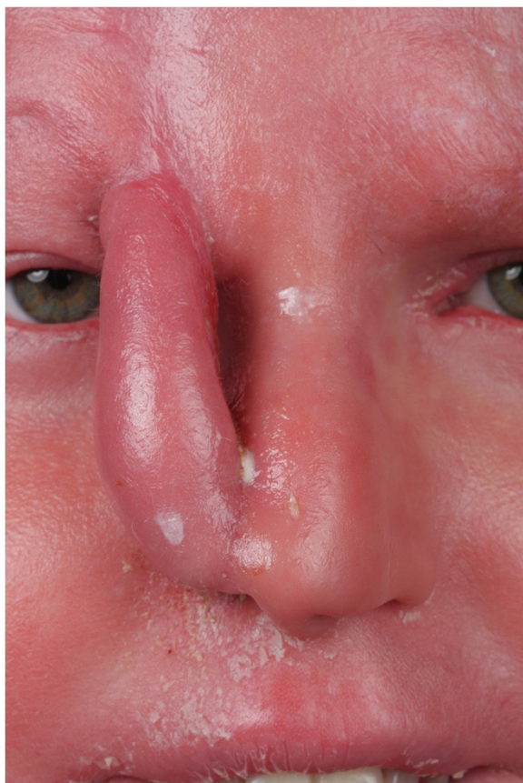
Figure 2 External lining reconstructed with paramedian forehead flap, three weeks after first stage procedure.